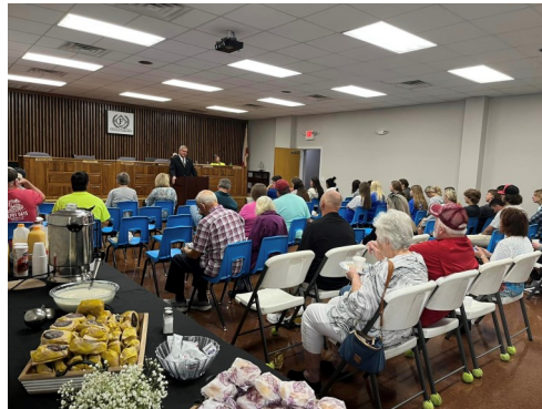
Jack McCaig Park